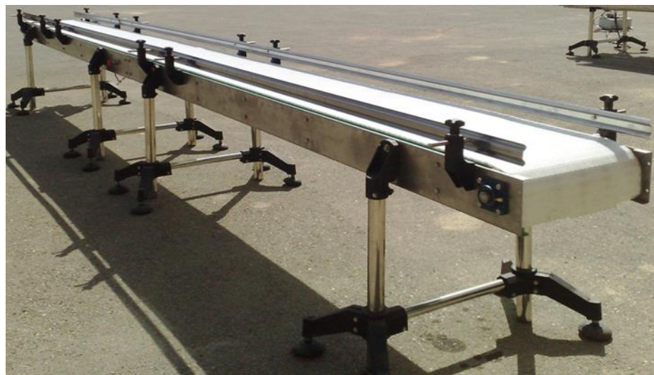
Wide width Conveyor with modular chain