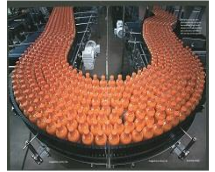
U form storage conveying system