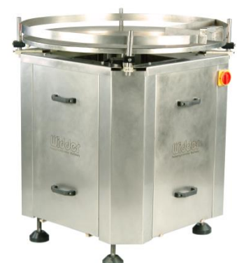
Container Storage round desk system