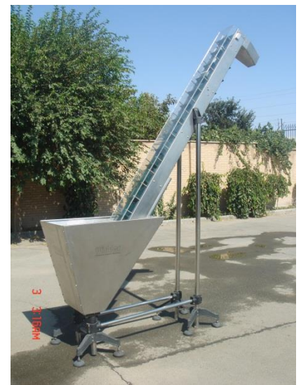
Hopper conveyor with reservoir