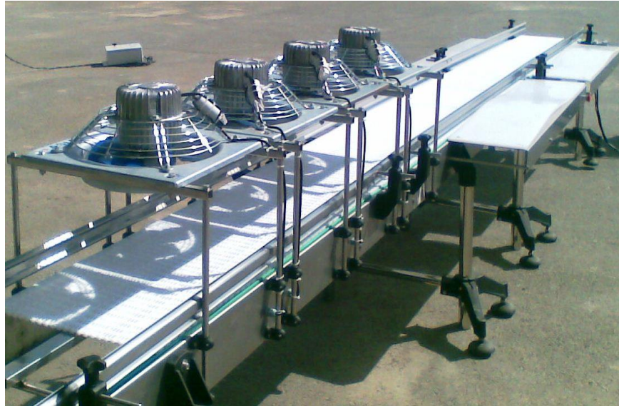
The wide width Conveyor equipped with drier fan

- The conveyor body has been enforced by tick stainless steel plates where driving system has been installed.